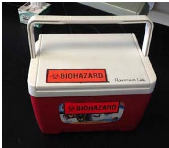
Fig. 2. Labeled, sealed, shatter-proof container for transporting agents between buildings.