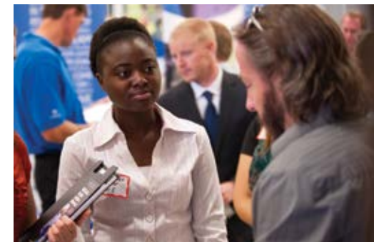
Learn about community businesses, organizations and resources as well as MSU student clubs at Catapalooza. Meet with recruiters at the bi-annual Career Fair.