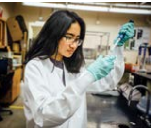
Walkable campus and hands on study