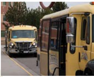
The convenient, safe and free Streamline Bus system.