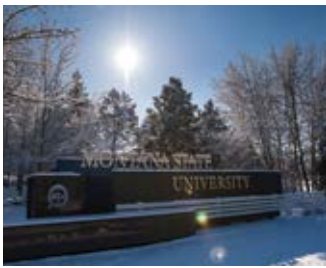
North campus entrance