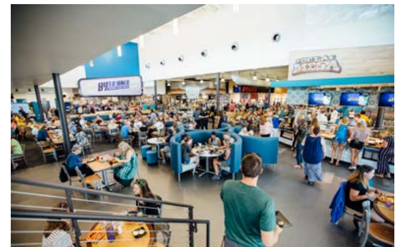
MSU's Rendezvous Dining Pavilion won grand prize from the National Association of College and University Food Services in 2019 (bottom right).