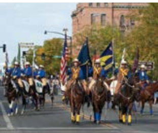
Homecoming Parade, Downtown Bozeman

“Here at MSU, we love Bozeman, and we aren't alone in thinking it is a great place: