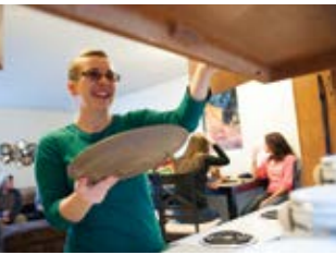
MSU's 11 residence halls give students the opportunity to stay in the center of campus life.